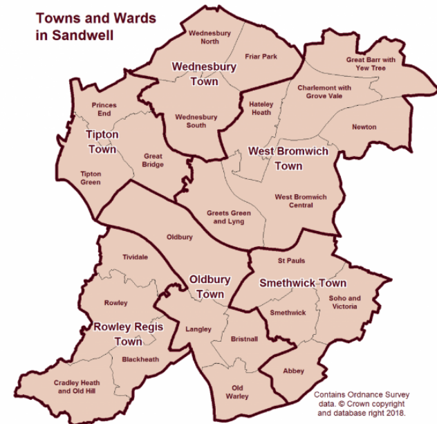
Towns and Wards in Sandwell